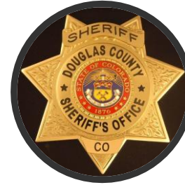
Douglas County Sheriff's Office