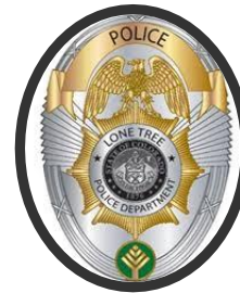
Lone Tree Police Dept