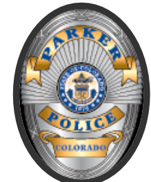
Parker Police Dept