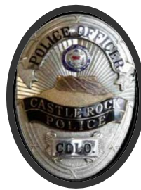
Castle Rock Police Dept