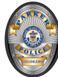
Parker Police Dept