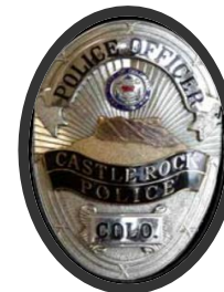
Castle Rock Police Dept