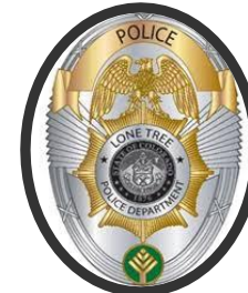
Lone Tree Police Dept