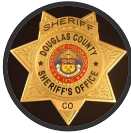
Douglas County Sheriff's Office